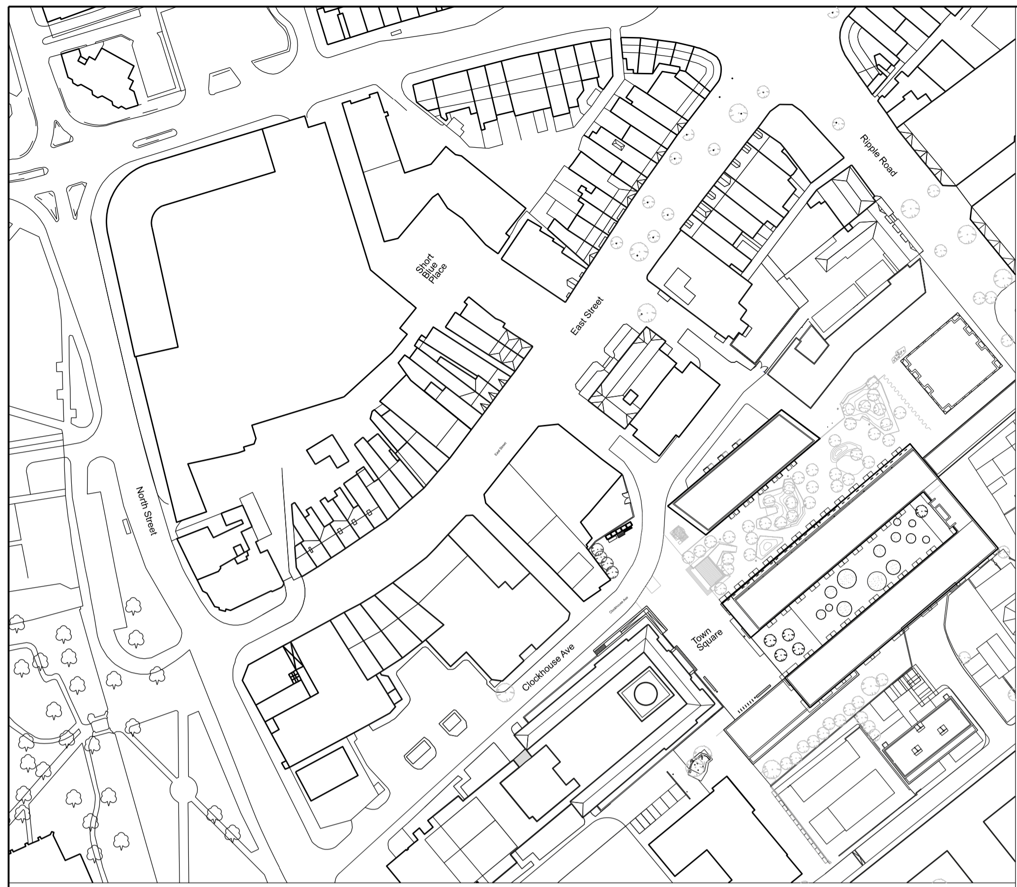
01 EXISTING: SITE LOCATION PLAN - 1:1250