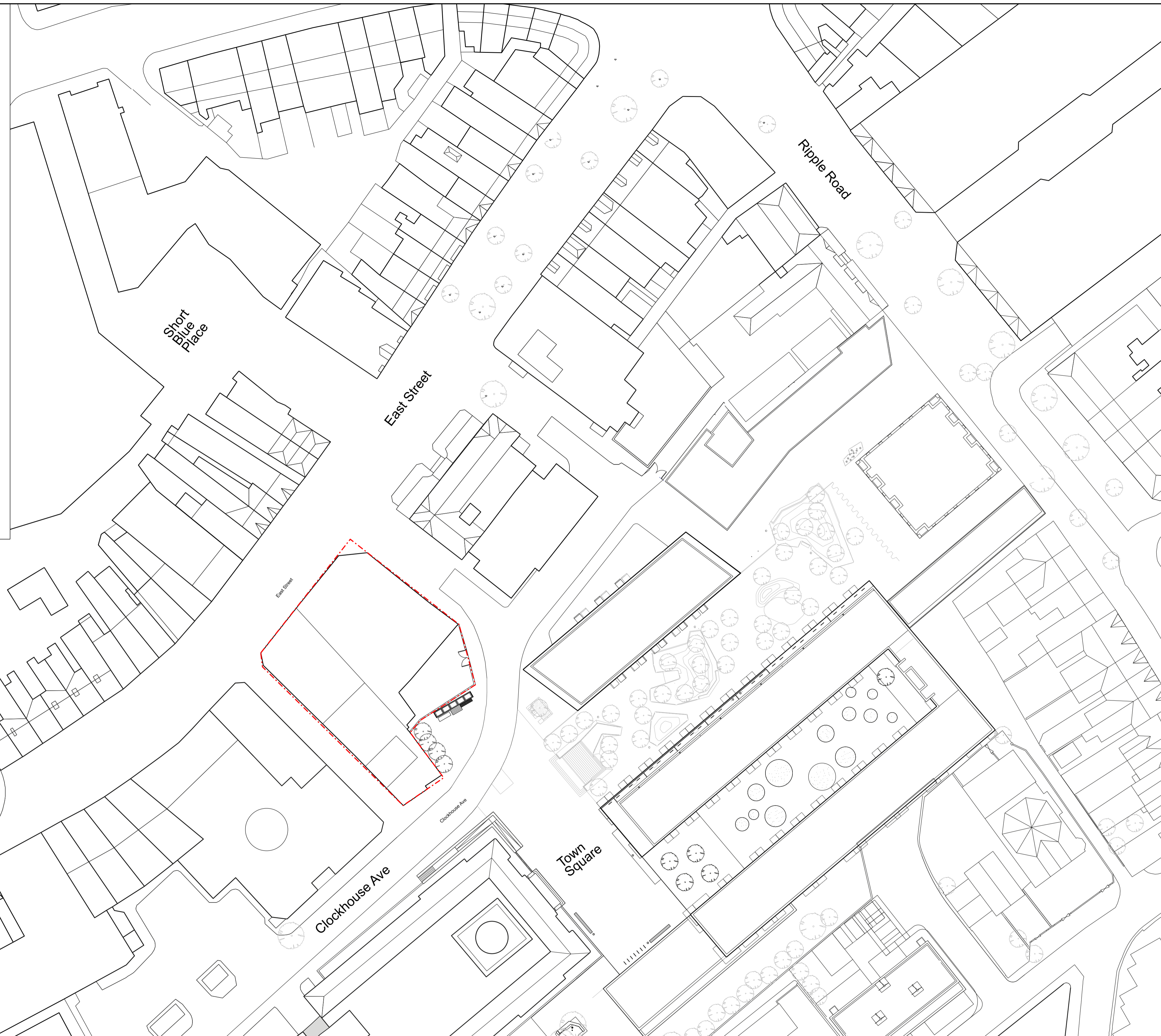
02 EXISTING: LOCATION PLAN - 1:500